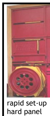
rapid set-up hard panel