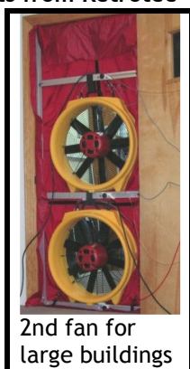
2nd fan for large buildings