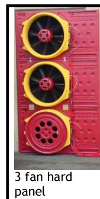
3 fan hard panel