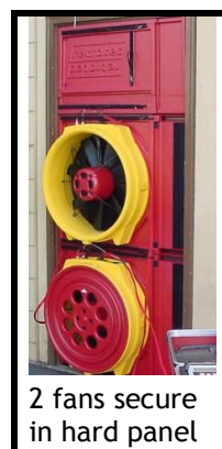
2 fans secure in hard panel